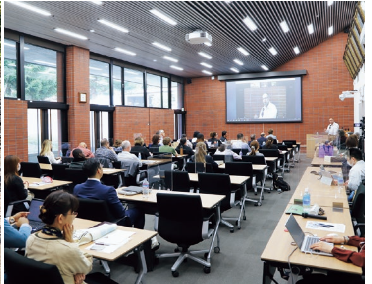
2023 Hokkaido University—The University of Melbourne Conference