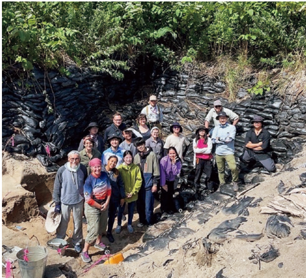
2023 Reibun Field School