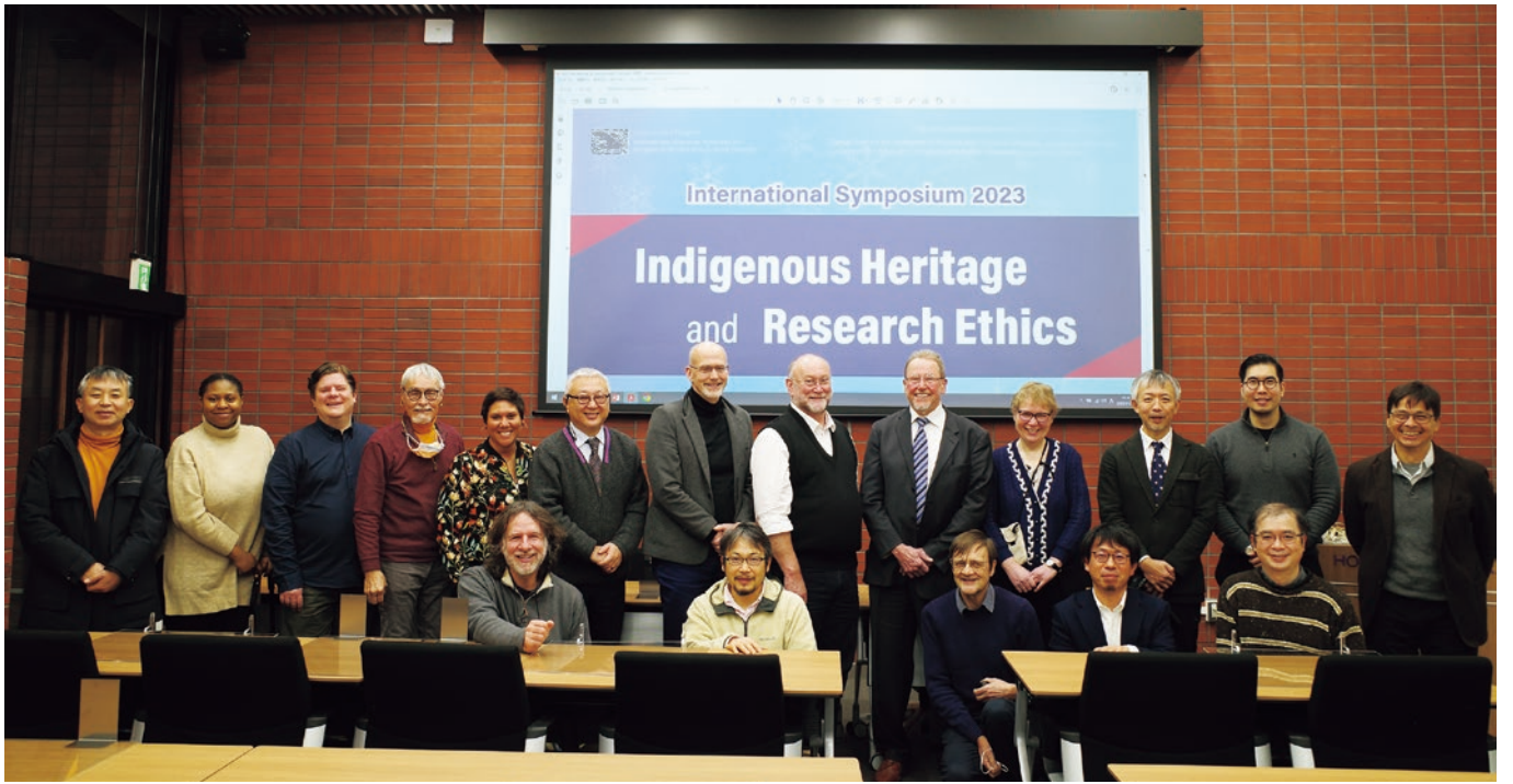
GSI Members in attendance at the 2023 Symposium